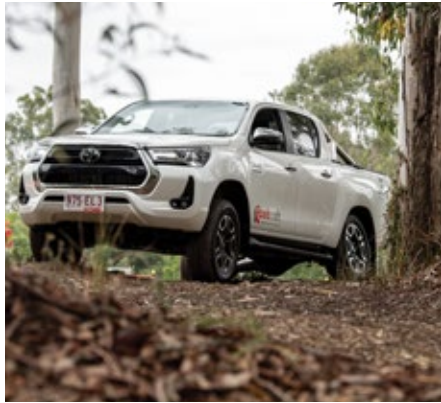
Extensive 4WD training tracks creek beds, ascent, and descent zones