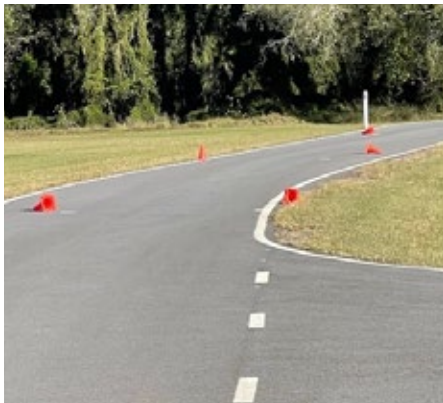
Simulated on-road bitumen training circuit