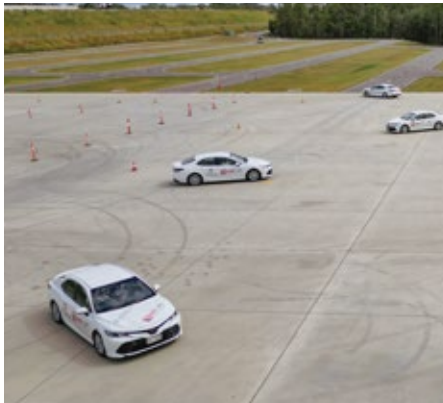
110m x 75m Vehicle dynamics area with optional wet skid pan and road circuits