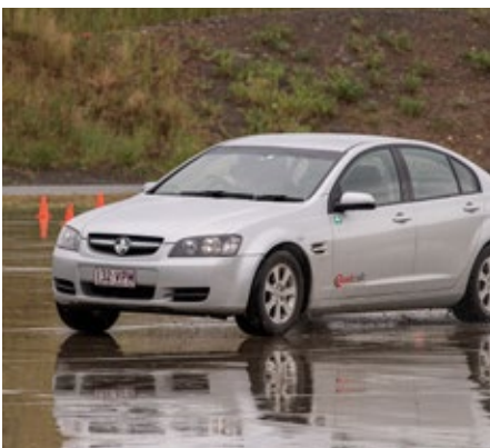
One rear-wheel drive, dual control Holden Commodore sedan.