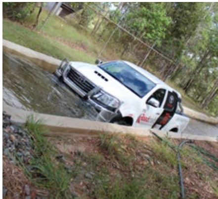
Purpose-built 4WD water crossing and traction-seeking pad