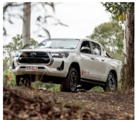
One Toyota Hilux 4x4