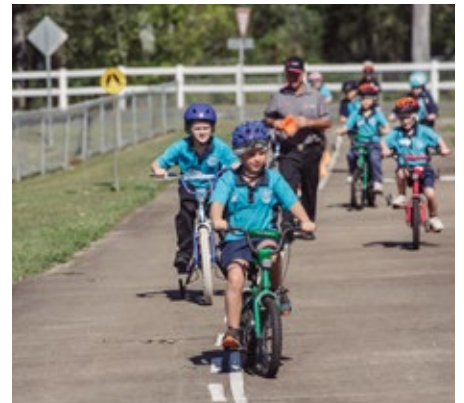
Dedicated bicycle training area for primary school students