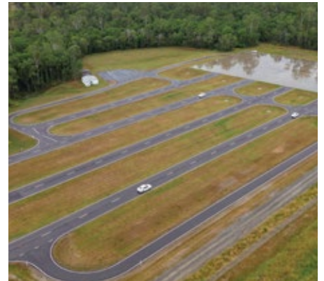
Bitumen feeder roads for slalom and braking exercises