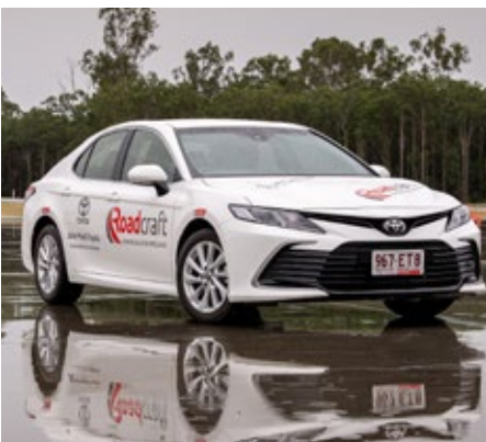
Five dual control Toyota Camry sedans