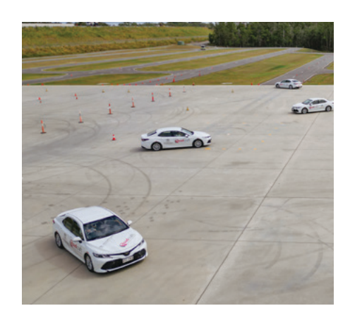
110m x 75m Vehicle dynamics area with optional wet skid pan and road circuits