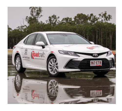
Five dual control Toyota Camry sedans