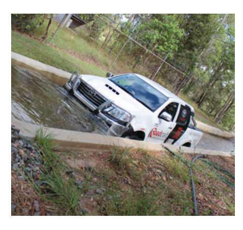
Purpose-built 4WD water crossing and traction-seeking pad