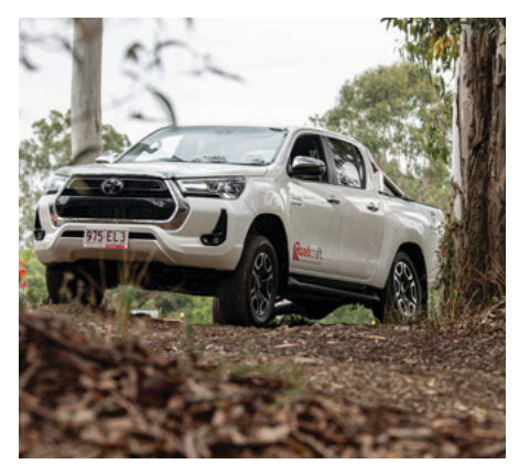
Extensive 4WD training tracks creek beds, ascent, and descent zones