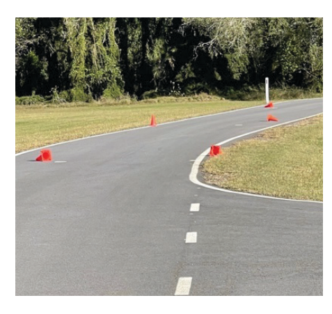
Simulated on-road bitumen training circuit