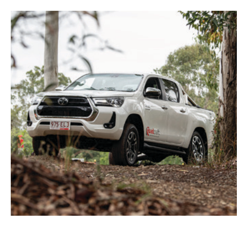
One Toyota Hilux 4x4