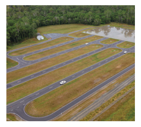
Bitumen feeder roads for slalom and braking exercises