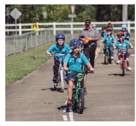
Dedicated bicycle training area for primary school students