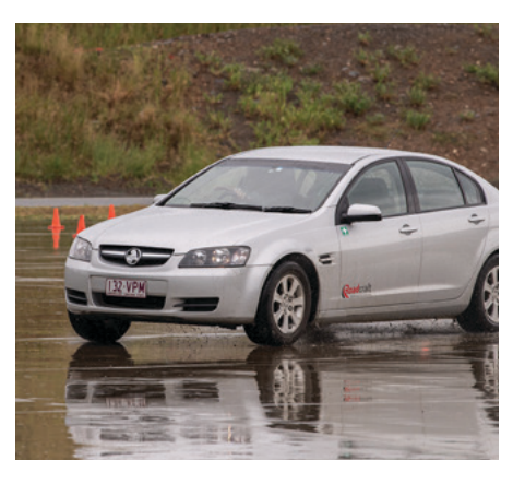
One rear-wheel drive, dual control Holden Commodore sedan.